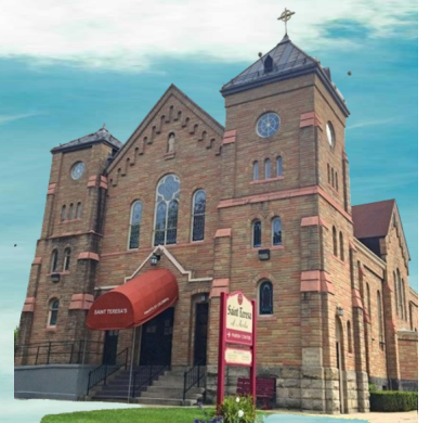
Saint Teresa of Avila Church 9 Third Avenue Union City, PA 16438